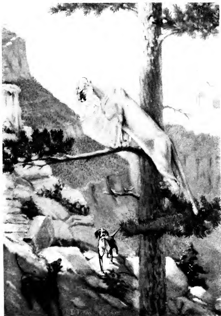
From a painting by Theodore B. Pitman in possession of Colonel Roosevelt.